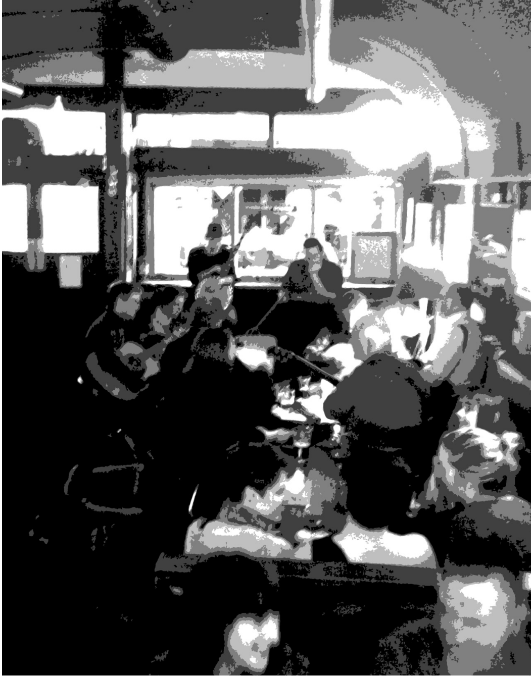
The Albar, Lower Stuart St, Dunedin